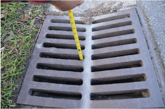
22 inches of space in southwest drain