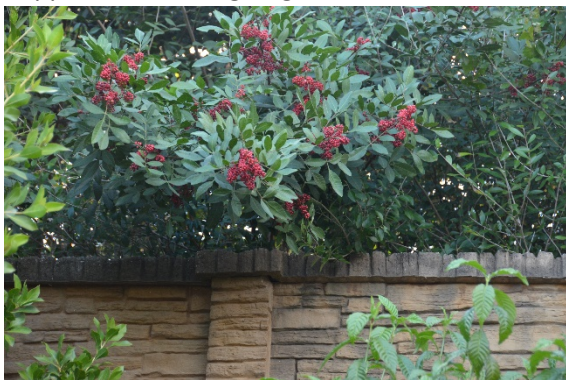
Along hole # 17

Pepper also starting to grow over the wall in a couple of locations