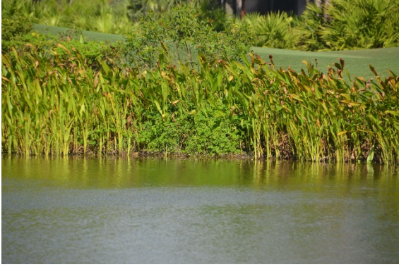
Lake 3 (11/19/2020)