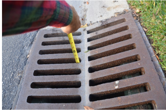
21 inches to top of debris in northeast drain