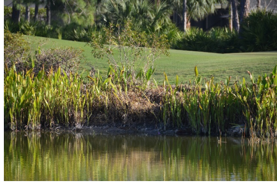
Lake 3 (12/29/2020)

New trees have been planted in littoral areas along Lake 24.