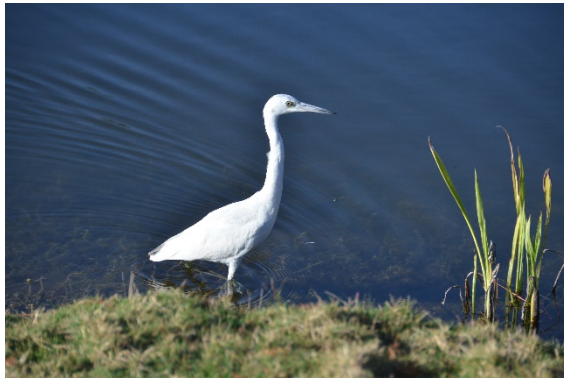
Little Blue Heron (white phase)