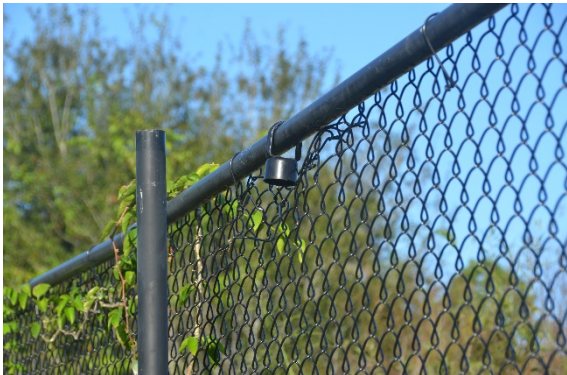
Cap still separated from post